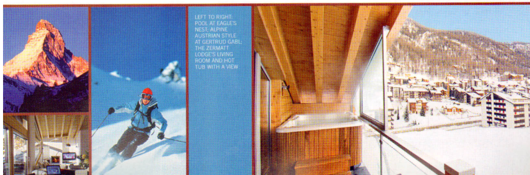
LEFT TO RIGHT: POOL AT EAGLE'S NEST, ALPINE AUSTRIAN STYLE AT GERTRUD GABL, THE ZERMATT LODGE'S LIVING ROOM AND HOT TUB WITH A VIEW

New in Zermatt this season Mogul aficionados can access the notorious Tiffl/Tstockhorn area once again, thanks to a new T-bar lift that serves the Stockhorn mountain station at 3,405m. ➡